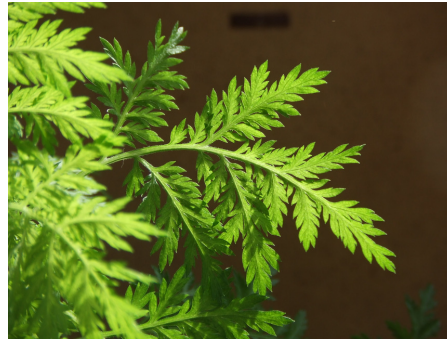
An artemisia leaf

Would you like to join in the work of anamed?