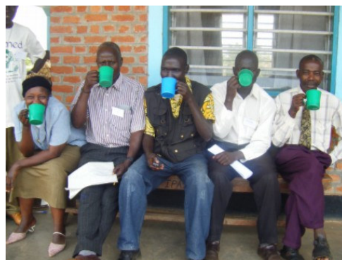
In Africa, as in Europe, drinking a range of locally available herbal teas makes an important contribution to good health